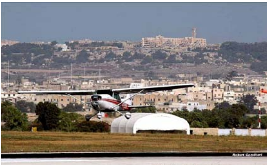
Mr. Mercieca's aircraft shown against Big Top Hangar at Malta international airport.

Mr. M: I got to know Big Top Shelters from one (of) my clients, the Malta Shipyards. They were doing a project for super yachts facilities. (It was the) Telescopic Big Top shelter covering a dry dock . I produced some aerial images of progress & completion. (I) was impressed by the size** and it happened that I needed a hangar for my aircraft (shown below).